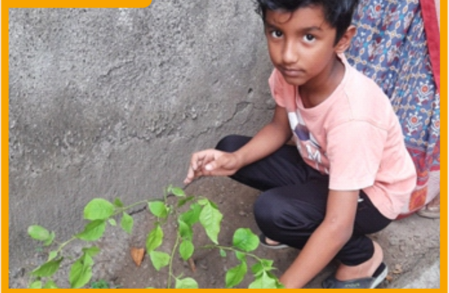
Week - 65