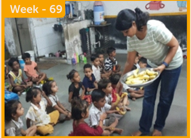
Week - 69