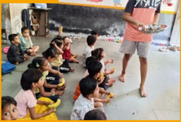
Week - 64