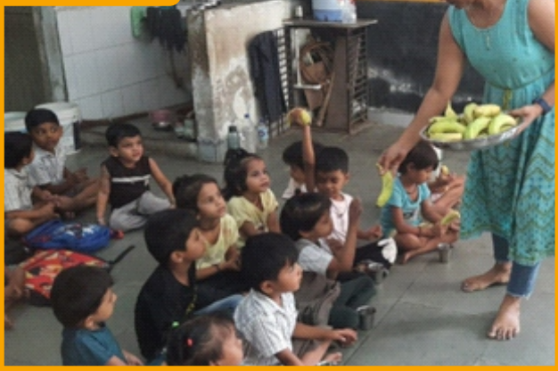
Week - 66