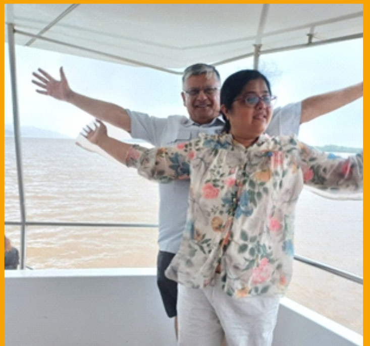
Youngest couple of our club!!