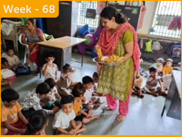
Week - 68